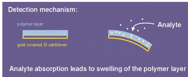
Fig. 3. Cantilever detection mechanism (IBM—Zurich).

communities. A report with recommendations of research needs and challenges has been published (see AAM mechanics, July 2003).